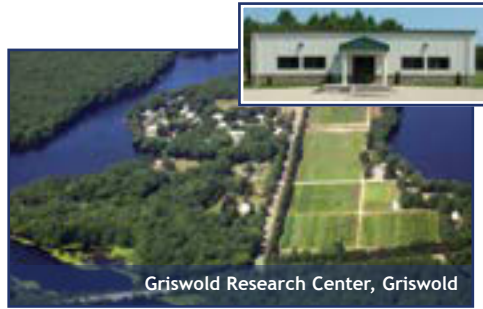
Griswold Research Center, Griswold

The Connecticut Agricultural Experiment Station is a state-supported scientific research institution dedicated to improving the food, health, environment, and well-being of Connecticut's residents since 1875.