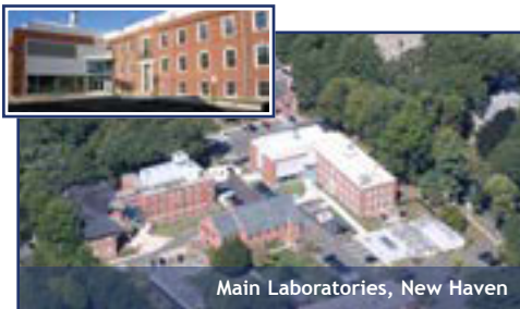
Main Laboratories, New Haven