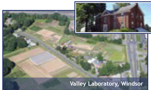
Valley Laboratory, Windsor