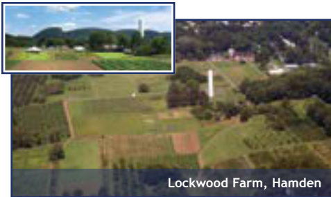
Lockwood Farm, Hamden